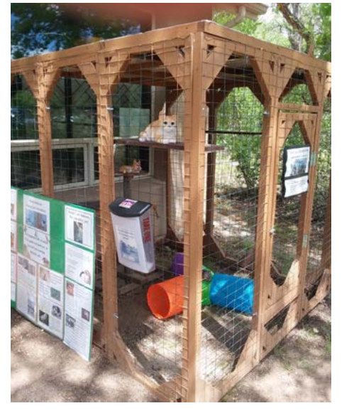
The CNMAS "catio" cat enclosure on permanent display at New Mexico Wildlife Rescue.