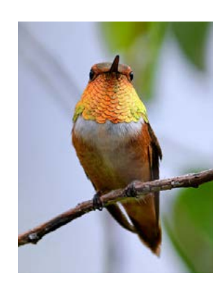
Rufous Hummingbird by Matt Zmuda

cream sale and archaeological tours led by the Heritage Site's museum staff. And hummingbirds, of course! Rivoli's, Calliope, Rufous, Broad-tailed and Blackchinned are all possible here. If you're feeling adventurous, the Gila Cliff Dwellings are in the neighborhood, as well as several birding hotspots, like Lake Roberts and Cherry Creek Campground. For more information about the festival call 575-536-3333 or copy and paste this link into your browser: http://www.silvercity. org/events/details/hummingbirdfestival-4839.