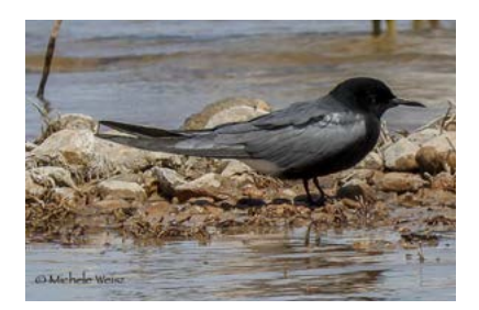
Black Tern

Barn Swallows swooped in and out of their nests under the entrance to the Visitor Center at Bitter Lake NWR, a Curve-billed Thrasher made forays in and out of its tightlywoven nest in a cactus, and a Scaled Quail called from a nearby wall while 20 Thursday Birders waited for the 10:00 start of the Birdathon. One team set off for the north and east tour roads, while the other team first went to view the Lesser Nighthawk roosting just outside of the residences, and then started down the west tour road, stopping when we heard Cassin's Sparrows calling and sky-larking from the scrub. Both teams converged at the oxbow where there were Snowy Plovers and a hoped-for Tri-colored Heron turned out to be a Green Heron.