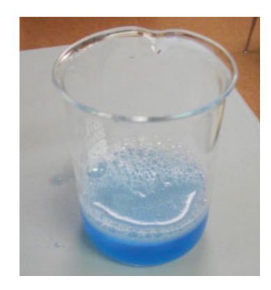
Students learned how soap works as an emulsifier