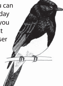
Black Phoebe drawing by Andrew Rominger

You'll be able to use the same user name and password for the Great Backyard Bird Count in February!