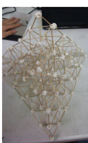
Students experimented by creating a tetrahedron with marshmallows and toothpicks.