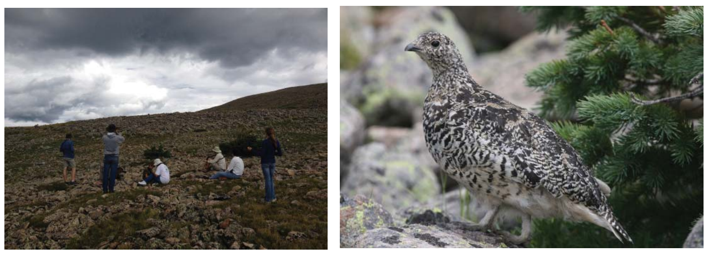
Jicarita Peak Ptarmigan Trek participants

Sixteen participants made the hike up Santa Barbara Ridge to search for White-tailed Ptarmigan. The trip got off to a great start with flyover Red Crossbills and Evening Grosbeaks at the trail head parking lot. We had only made it a little way up the trail when we encountered a nice mixed flock that contained, among other species, Hammond's Flycatcher and the first Townsend's Warblers of fall. As we continued up the mountain the group began to split up but most saw American Three-toed Woodpecker and Gray Jay. When we finally made it above the treeline at the base of the ridge several Pine Grosbeaks allowed close looks and a Clark's Nutcracker flew by. As the group soldiered up the ridge several Wilson's Warblers were seen and we heard many singing White-crowned Sparrows, along with calling Pika and Yellow-bellied Marmots. Fortunately for us several participants made it to the top before the rest of the group and had already found the ptarmigan before everyone else arrived! The whole group was treated to close-up views of a hen and her chick foraging among the boulders as we ate lunch. The last participants to make it up the ridge saw the ptarmigan just as a storm hit and we were forced back down the hill. A total of 38 species were seen on the hike.