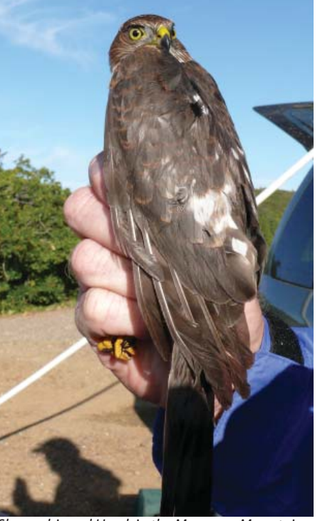
Sharp-shinned Hawk in the Manzano Mountains

Spend a weekend working side by side with our field biologists and get a glimpse of what it's like to live on a western mountain range monitoring raptors!