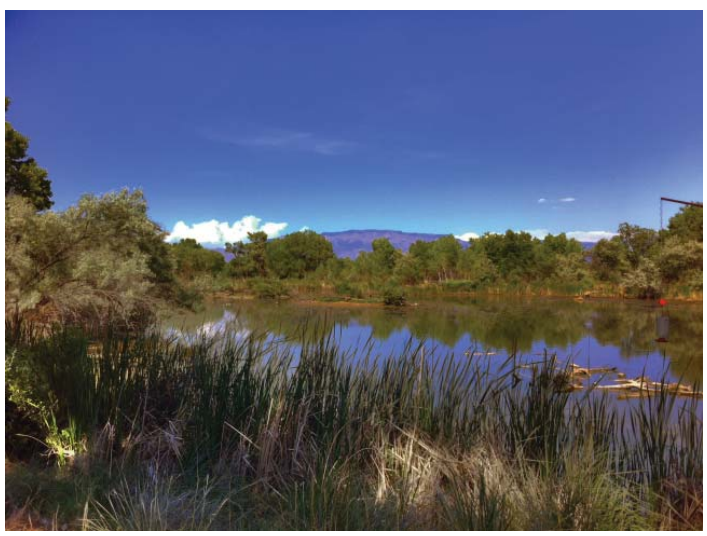
Rio Grande Nature Center State Park

The 8th annual Gila River Festival – planned in and around Silver City, September 13-16, 2012 – will celebrate through storytelling the natural and cultural heritage of the Gila River, New Mexico's last free-flowing river. One of the Southwest's premier nature festivals, the Gila River Festival attracts an audience of nature lovers and outdoor enthusiasts eager to learn about and experience the Gila's natural wonders. Festival attendees will enjoy a variety of expert-guided field trips in the Gila National Forest and along the Gila River, a keynote talk by author Craig Childs, workshops, horseback riding, kayaking, visual and performing art exhibits and performances, a three-minute film fest, a downtown art walk, and more. Visit www.gilaconservation.org to learn more and to register for events.