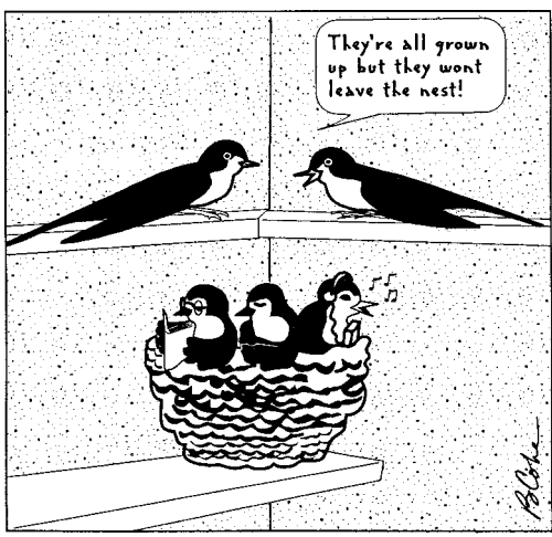
Sometimes birds are alot like humans.

This column is a summary of an article reported by the Associated Press which is copyrighted and could not be reprinted.