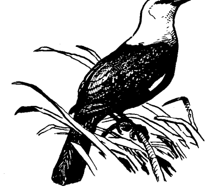
CHRISTMAS BIRD COUNTS COMING SOON

The time frame for future Christmas Bird Counts is as follows: