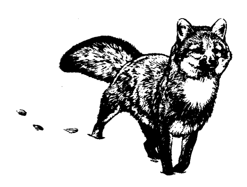
IRONIC COVER PHOTO

EPA has not yet announced its decision on whether there will be further hearings on the issue.